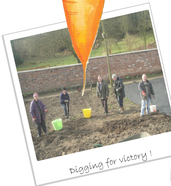
Digging for victory!

Come & Join Us! Have fun, keep fit and help this vital local service.