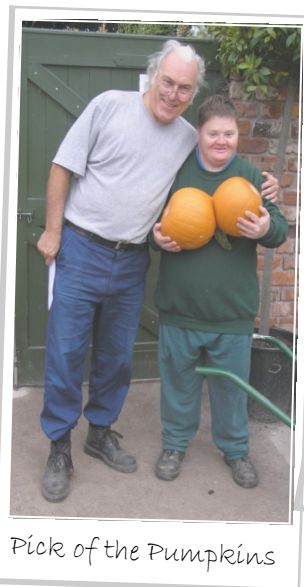
Pick of the Pumpkins