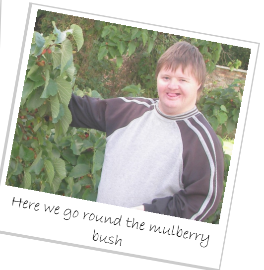
Here we go round the mulberry bush